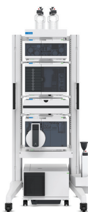
Agilent FlexBench MS (G6015B*) for Agilent Ultivo QQQ LC/MS and InfinityLab LC/MSD