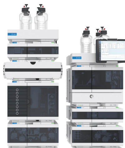
1290 Infinity II LC Workflow