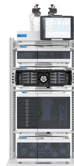
Agilent Benchtop (5043-1740*)