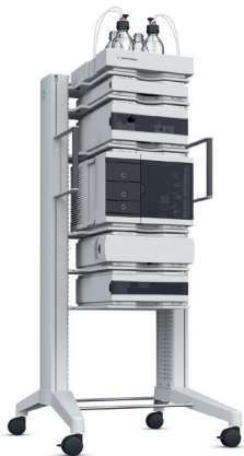
Agilent FlexBench (5043-1759*)