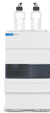
1220 Infinity II LC Workflow