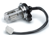
InfinityLab Long-life HiS Deuterium Lamp